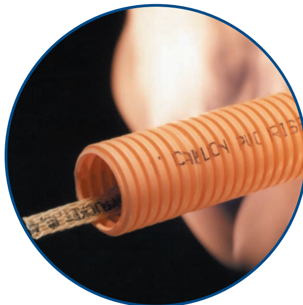
Applications: Riser and General Purpose.