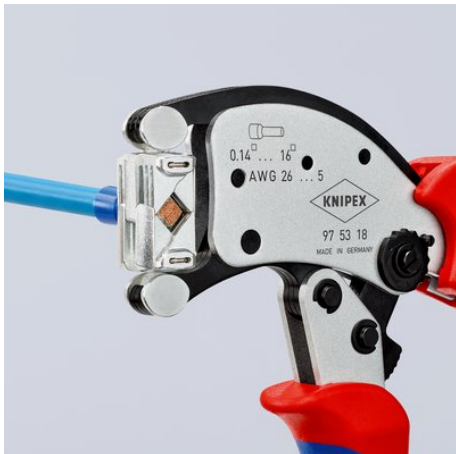
Uniquely flexible: connectors can be inserted in the rotatable crimp head from almost any position