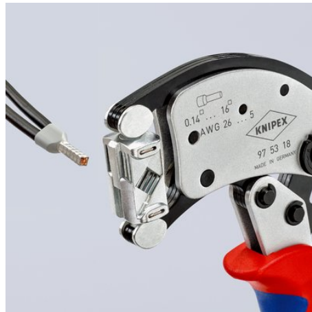
Twin wire ferrules up to 2 x 6 mm² can be crimped without adjustment