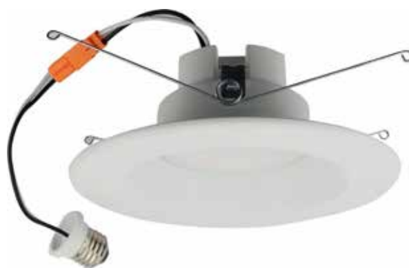
5" - 6"