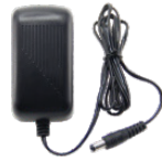
AC/DC Charger (included in the box)