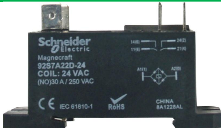
New Product Front