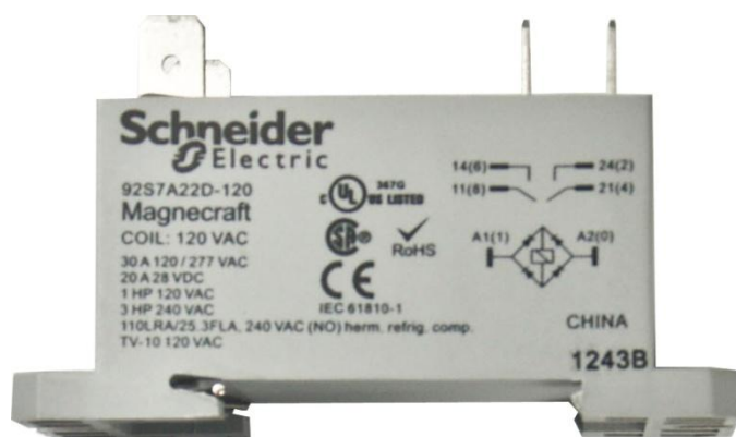
Current Product Front