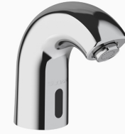
Variation not shown: 4" Trim Plate