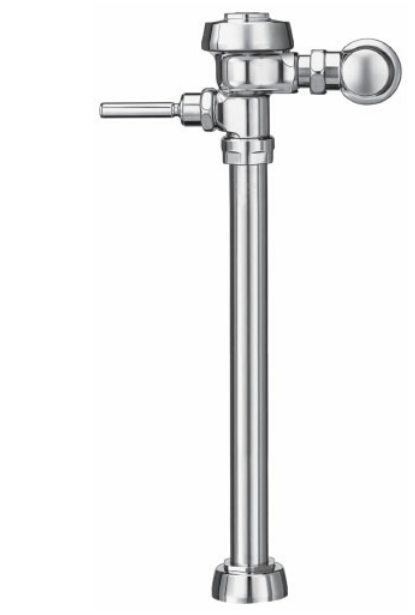
Royal Model 117 Shown

All information contained within this document subject to change without notice.