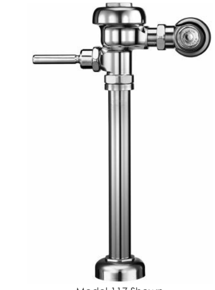
Model 117 Shown

See Accessories Section of the Sloan catalog for available accessories