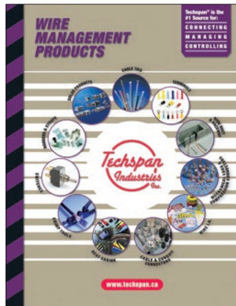
Techspan Wire Management Products Part# TI2011WMP