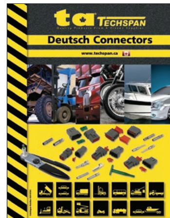
Deutsch Connectors Catalogue Part# 2014TDC