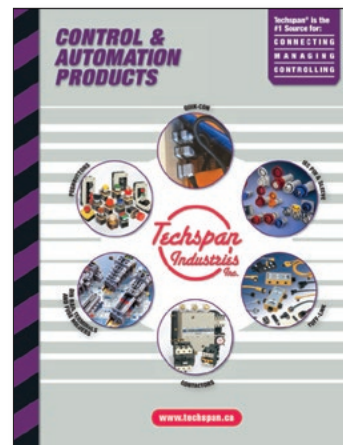
Techspan Control & Automation Products Part# TI2011CAP