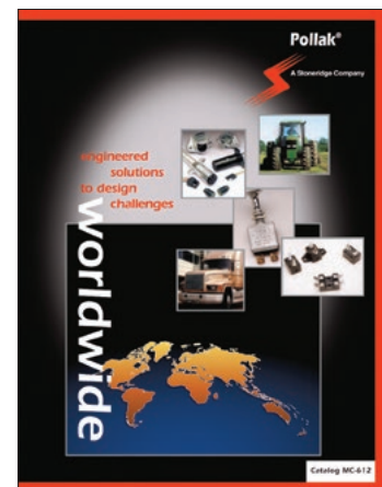
Techspan/Pollak Heavy-Duty Electrical Controls' Products Part# MC-612