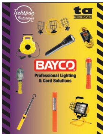
Bayco Professional Lighting & Cord Solutions Part# TB2011 Watch for our NEW Catalogue in 2015!