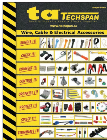
Techspan Wire, Cable & Electrical Accessories Catalogue Part# 2015WCE