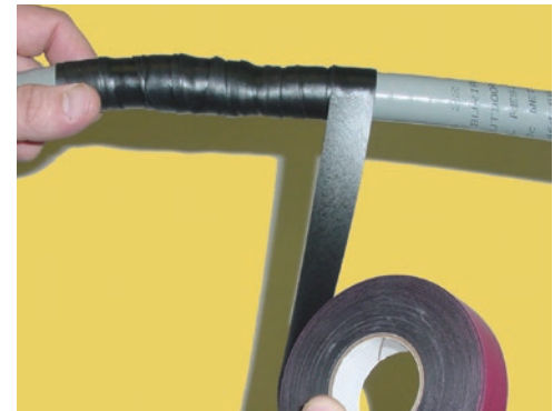
Tape will create a sealed protective covering