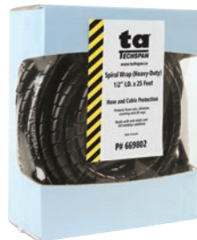
Heavy-Duty Spiral Wrap (Packaging)