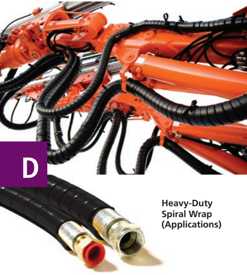
Heavy-Duty Spiral Wrap (Applications)