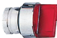
PB-BK124 / PB-BK134