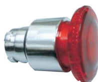
PB-BW44 / PB-BW64