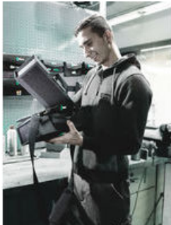
Wera 2go 1 – The outside packer