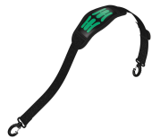
Wera 2go 6 05004355001 1 x 1470 x 38 mm