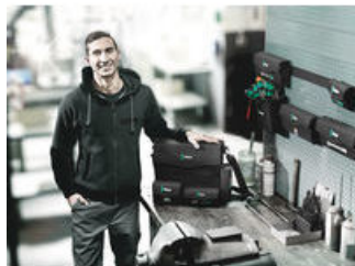
Wera 2go 2 – The outside and inside packer