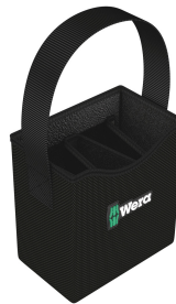
Wera 2go 4 05004353001 1 x 105 x 165 x 165 mm