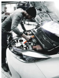
Zyklop VDE ratchet and accessories