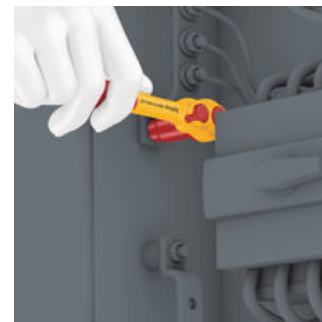
The extremely slim design of the Zyklop VDE ratchet makes it easy to work, even in confined spaces.