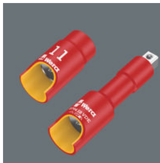
The Zyklop VDE sockets and extensions offer increased safety thanks to their 2-component isolation with yellow insulation core under red insulation outer layer.