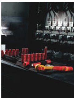
Zyklop VDE ratchet and accessories