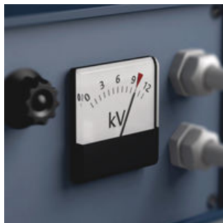
The individual testing of the Zyklop VDE tools at 10,000 volts, in accordance with IEC 60900, guarantees safe working under voltages up to 1,000 volts.