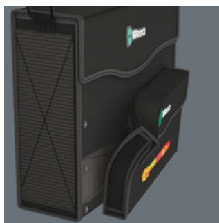
The textile box of the ratchet set 8100 SB VDE 1 is suitable for attachment to wall, shelf, workshop trolley and the Wera 2go system due to its back located hook and loop fastener strip.