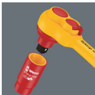
The ball lock ensures sockets and accessories are securely fitted, providing increased safety during operation. A short press on the release button allows the tool to be changed quickly.