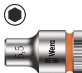
8790 HMA 05003504001 1 x 5,5 x 23 mm 05003505001 1 x 6 x 23 mm 05003506001 1 x 7 x 23 mm 05003507001 1 x 8 x 23 mm 05003509001 1 x 10 x 23 mm 05003511001 1 x 12 x 23 mm 05003512001 1 x 13 x 23 mm