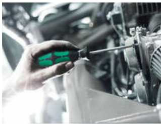
Kraftform Screwdrivers Series 300