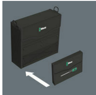
Suitable for docking with the Wera 2go system.