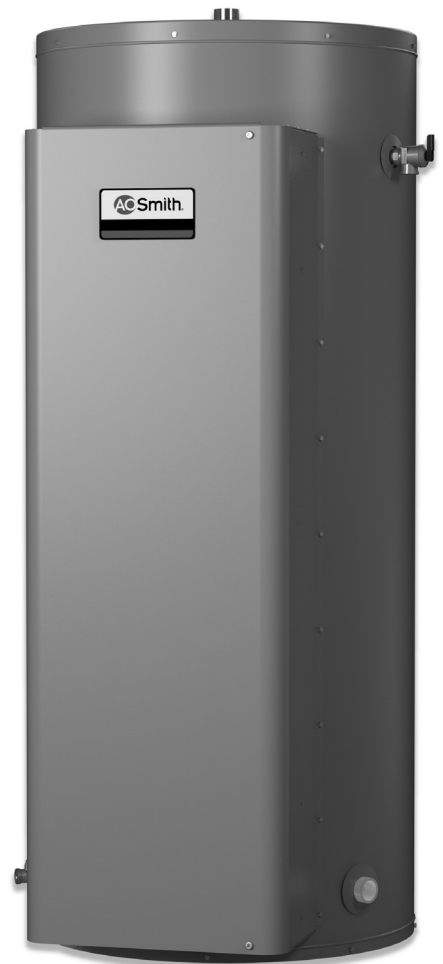
MODELS DRE-52, 80, 120