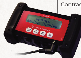
52082U GeniSys Contractor Tool

to fully utilize the features of the GeniSys advanced burner control. The GeniSys Contractor Tool allows a technician to monitor and program the primary control variables. The display shows current burner status, control timings, and burner cycle history. The display's programming mode allows a technician to customize both the pre-time and post-time settings and a lockout service message.