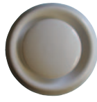
EXHAUST & SUPPLY GRILL