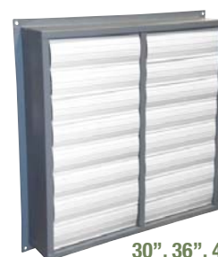
30", 36", 42" & 48" MODELS WITH PVC LOUVERS