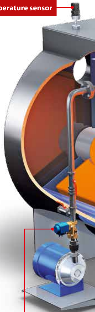
EV220B solenoid valve