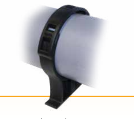
Provides lateral pipe support

For recommended maximum support spacing of IPEX piping systems, please consult our online technical manuals.