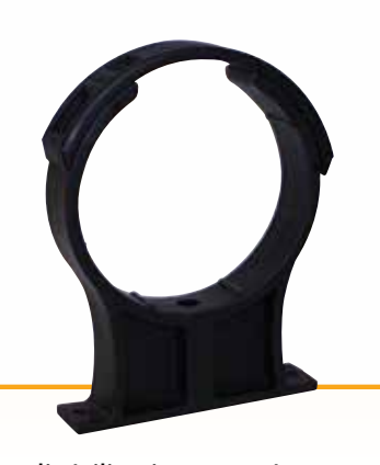
No reliability issues when used in corrosive environments