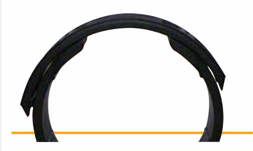
Retaining band prevents unwanted opening of pipe clip