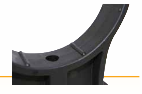
Friction reducing ribs to permit pipe expansion/contraction