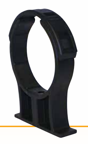
Heavy duty design with a wide pipe contact surface area