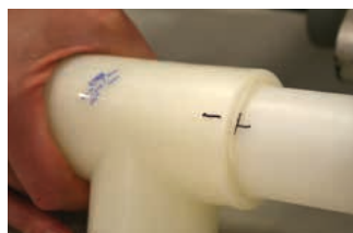
TABLE 2 – PIPE INSERTION LENGTH

NOTE: Never dip the joint into water or expose it to a forced airstream in order to cool it quickly as this will result in weak joints.