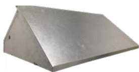
Galvanized cover PN: 960000