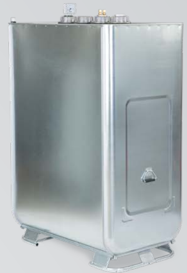
2 IN 1 TANK