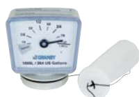
Gauge PN: 962247 – 720 L / 962248 – 1000 L