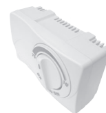
GF-MHX3 Manual Humidistat Included in GF-1042DMM