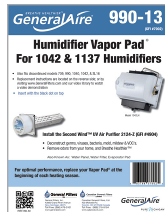
GF-990-13 Vapor Pad®