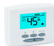
GF-X3 Digital Humidistat Included in GF-1042DMD