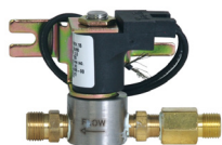
GF-990-53 Solenoid Valve