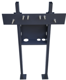
IWC2104 In-wall carrier for Medi-flo 2030036896 IWC2104

Special hospital equipment | Ozone technology