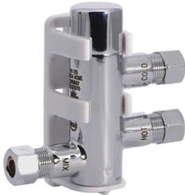
MIX-LF Mixing valve for Aquarius faucets 2000102504 MIX-LF