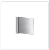
AT6506-BN Brushed Nickel