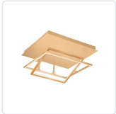
FM16126-SG Soft Gold