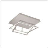
FM16126-BN Brushed Nickel

* For custom options, consult factory for details.