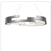
PD12732-BN Brushed Nickel