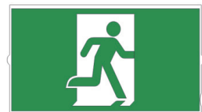
Without Arrow 1 pc