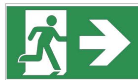
With Arrow 2 pcs