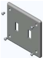
RTSC20-2 Double Switch

Cover markings are as specified in CSA C22.2 No. 42.1 and UL 514D.