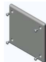
RBRC20-2 Double Blank