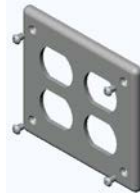
RDRC20-2 Double Duplex