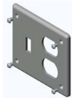
RTSDC20-2 Combo Switch/Receptacle