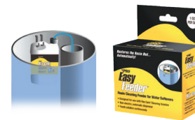
SIM Series includes Pro Easy Feeder Starter Kit.