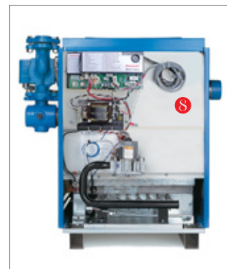
Typical MG 100 E PS interior with Electronic Ignition.

A durable and attractive panel protects controls and wiring.