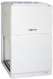
Viessmann AirflowPLUS hydronic air handler