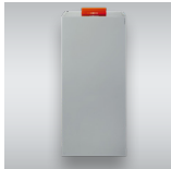
Vitocrossal 300, CU3A