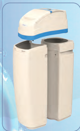
Removable brine tank with sliding salt lid

* Compared to conventional calendar clock models