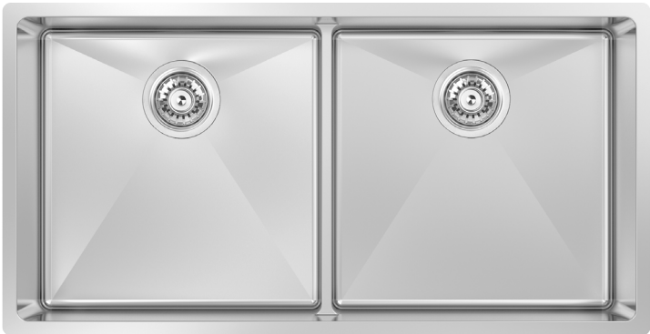
Montego 34" Double 50/50