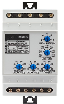
PMD Series with mounting clips extended

Phase Unbalance: Adjustable from 2 - 10% unbalance. Unit trips when any one of the three lines deviates from the average of all three lines by more than the adjusted set point for a period longer than the adjustable trip delay.