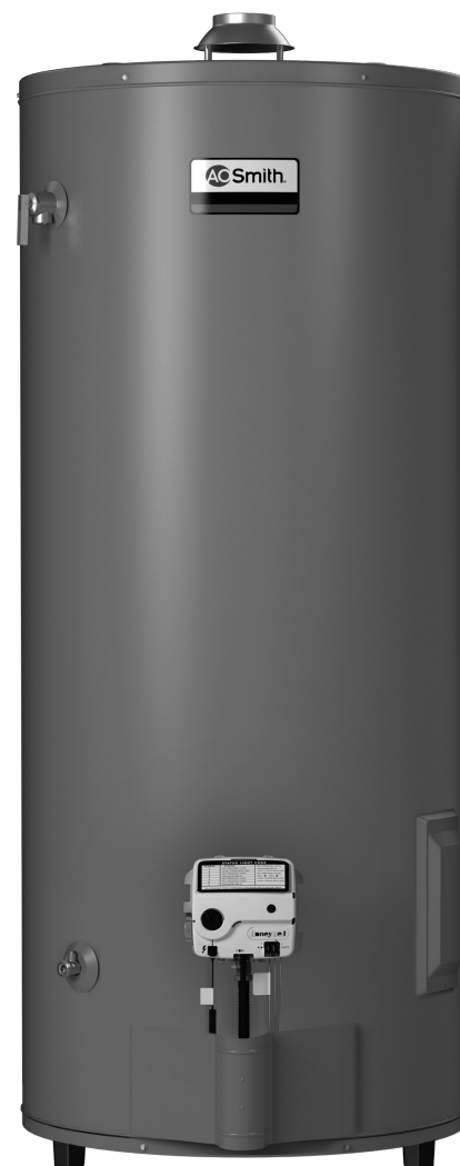
BT-80 & BT-100