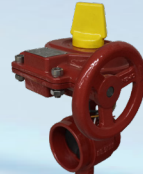
W50-A-ED-GG-S-GO Grooved Butterfly Valve Epoxy Coated DI Body, EPDM Disc NPS 2-12, Gear Operated

ANSI/NSF61 Drinking Water Components ANSI NSF372 Lead Free