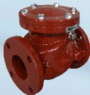
W30-A-RD-FF AWWA C508 Swing Check Valve Epoxy Coated DI Body NPS 2-12, 300CWP, ANSI125 Fldg.