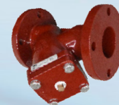
W40-A-YX-FF Strainer, Y-Type, ANSI125 Fldg. Epoxy Coated, DI Body, 304SS Screen 300CWP, NPS 2-12 No FM