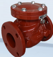
W30-A-RD-FF AWWA C508 Swing Check Valve Epoxy Coated DI, Body, EPDM Disc Brz. Seat 300CWP, NPS 2-12 ANSI Fldg.