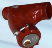
W40-A-YX-GG Strainer, Y-Type, SS Cap Epoxy Coated, DI Body, 304SS Screen 300CWP, NPS 2-12 Grooved Ends