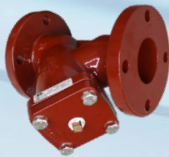
W40-A-YX-FF Strainer, Y-Type Epoxy Coated, DI Body, 304SS Screen 300CWP, NPS 2-12 ANSI125 Flanged Ends