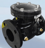
W35-A-RD-FF Swing Check Valve Enamel Coated, DI Body NPS 2-12, 300CWP, ANSI125 Fldg.