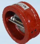
W30-A-ED-WW-S Wafer Style, Double Door Check Valve Epoxy Coated DI Body, 316 SS EPDM Seat, NPS 2-16, 300CWP