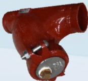
W40-A-YX-GG Strainer, Y-Type, Grooved Ends Epoxy Coated, DI Body, 304SS Screen SS Cap, 300CWP, NPS 2-12 No FM