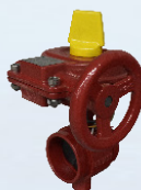
W50-A-ED-GG-S-GO Grooved Butterfly Valve NPS 2-12 HF-Epoxy Coated DI Body EPDM Seat, Gear Operator