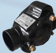
W35-A-RD-GG-G C508, Grv. Swing Check Valve Enamel Coated DI Body, EPDM Disc Brz. Seat, 300CWP, NPS 2-12 Large Drain