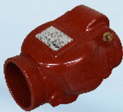
W30-A-RD-GG AWWA C508 Swing Check Valve Epoxy Coated DI Body NPS 2-12, 300CWP, Grooved Ends