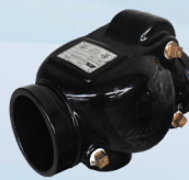
W35-A-RD-GG Grooved Swing Check Valve Enamel Coated, DI Body NPS 2-12, 300CWP, Grooved Ends