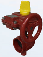
W50-A-ED-GG-S-GO-A Grooved Butterfly Valve, NPS 2-12 Epoxy Coated DI Body, EPDM Seat Supervised Gear – Normal Open