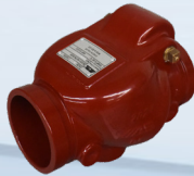
W30-A-RD-GG AWWA C508 Swing Check Valve Epoxy Coated DI Body, EPDM Disc Brz Seat, NPS 2-12 Grooved Ends