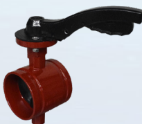
W50-A-ED-GG-S-LL Grooved Butterfly Valve NPS 2-12 HF-Epoxy Coated DI Body EPDM Seat, L-Lever Handle

ANSI / NSF61 - Drinking Water Components