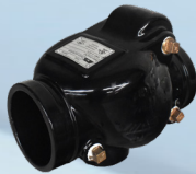
W35-A-RD-GG C508, Grv. Swing Check Valve Enamel Coated DI Body, EPDM Disc Brz. Seat, 300CWP, NPS 2-12