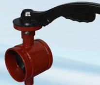
W50-A-ED-GG-S-LL Grooved Butterfly Valve Epoxy Coated DI Body EPDM Disc NPS 2-12, Lever Handle