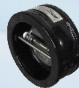
W35-A-ND-WW-S Wafer Style Double Door Check Valve Enamel Coated, DI Body, 316 Disc NBR Seat, NPS 2-16, 300CWP