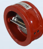
W30-A-ED-WW-S Wafer Style, Double Door Check Valve Epoxy Coated DI Body, 316SS Discs EPDM Seat, 300CWP, NPS 2-16