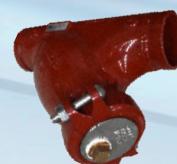
W40-A-YX-GG Strainer Y-Type, 304SS Screen Epoxy Coated DI Body NPS 2-12, 300CWP, Grooved Ends