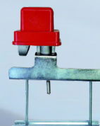
B-1-OSY Gate Valve Supervisory Switch For valve sizes, NPS 2-16 (B-2-OSY for NPS 18-24)