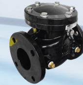
W35-A-RD-FF C508, Fldg. Swing Check Valve Enamel Coated DI Body, EPDM Disc Brz. Seat, 300CWP, NPS 2-12