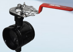
W55-A-ED-GG-S-IL Grooved Butterfly Valve NPS 2-6 Enamel Coated, DI Body EPDM or NBR Seat, Infinite Lever