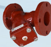
W40-A-YX-FF Strainer, Y-Type, 304 Screen Epoxy Coated DI Body NPS 2-12, 300CWP, ANSI125 Fldg.