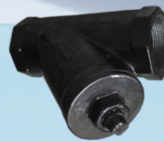
W-45-A-YX-FN Strainer Y-Type 304 SS Screen Enamel Coated, DI Body NPS 1/4-3 FM Threaded Ends