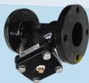
W45-A-YX-FF Strainer, Y-Type, 304SS Screen Enamel Coated, DI Body NPS 2-12, 300CWP, ANSI125 Fldg.