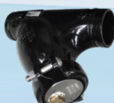
W45-A-YX-GG Strainer Y-Type, 304SS Screen Enamel Coated, DI Body NPS 2-12, 300CWP, Grooved Ends