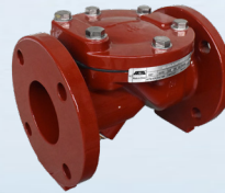
W30-A-EP-FF-F Pump Check Valve Epoxy Coated DI Body, NBR Disc 300CWP, ANSI125 Flanged Ends