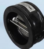
W35-A-ND-WW-S Wafer Style, Double Door Check Valve Enamel Coated DI Body, 316SS Discs NBR Seat, 300CWP, NPS 2-16