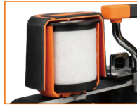
High Performance Oil Mist Filter