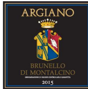
Argiano Brunello di Montalcino

Ruby red wine color, tending toward garnet with age, this wine offers complex, penetrating aromas of wild berry fruit. On the palate, it is dry, firm, harmonious and delicate. Great with roasts, grilled and spit-roasted meats, game, braised meats and aged cheeses.