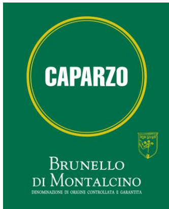
Caparzo Brunello di Montalcino

Ruby red wine color, tending toward garnet with age, this wine offers complex, penetrating aromas of wild berry fruit. On the palate, it is dry, firm, harmonious and delicate. Great with roasts, grilled and spit-roasted meats, game, braised meats and aged cheeses.