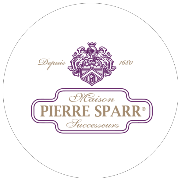
Pierre Sparr Pinot Blanc