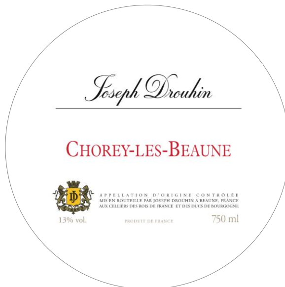
Joseph Drouhin Choresy Les Beaune