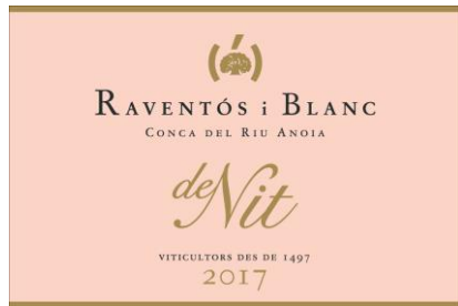
Raventos i Blanc de Nit Rose

The vines of the Barbera, Plana and Viader plots have deep soil with a clay loam texture, which provides us with freshness and elegance. The Monastrell plot, situated on the terraces on Serral hill, marks the De Nit sparkling wine with its personality.