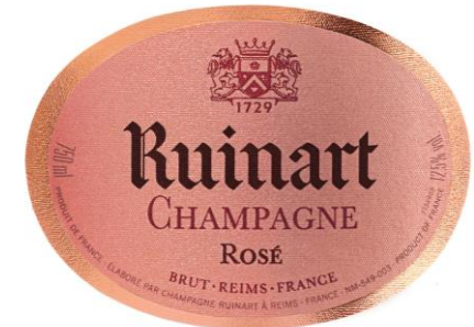
Ruinart Brut Rose

Dominated by Pinot Noir, this wine offers a perfect balance of structure and finesse. Golden-yellow, with a foaming necklace of tiny bubbles. Reminiscent of yellow and white fruits, which unfold with notes of vanilla and brioche. Balance between the fruity aromas (from the grape varieties) and the toasty aromas (a result of the three years of bottle aging). The first sip delivers the freshness and strength typical of Veuve Clicquot Yellow Label with a symphony of pear and lemon fruit. It is a true member of the Brut family, well structured, admirably vinous. Veuve Clicquot Yellow Label manages to reconcile two opposing factors - strength and silkiness - and to hold them in perfect balance with aromatic intensity and a lot of freshness.