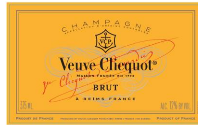
Veuve Clicquot Yellow Label Brut

The color is an elegant golden straw yellow with amber highlights. Its aromas are radiant, revealing bright yellow-fleshed fruits (apple, pear, yellow peach), honey, floral nuances (lime blossom) and elegant blond notes (brioche and fresh nuts). The palate is seductive, richly flavorful and smooth combining generosity and subtlety, fullness and vigor, followed by a delicately fresh crispness (fruit with seeds).