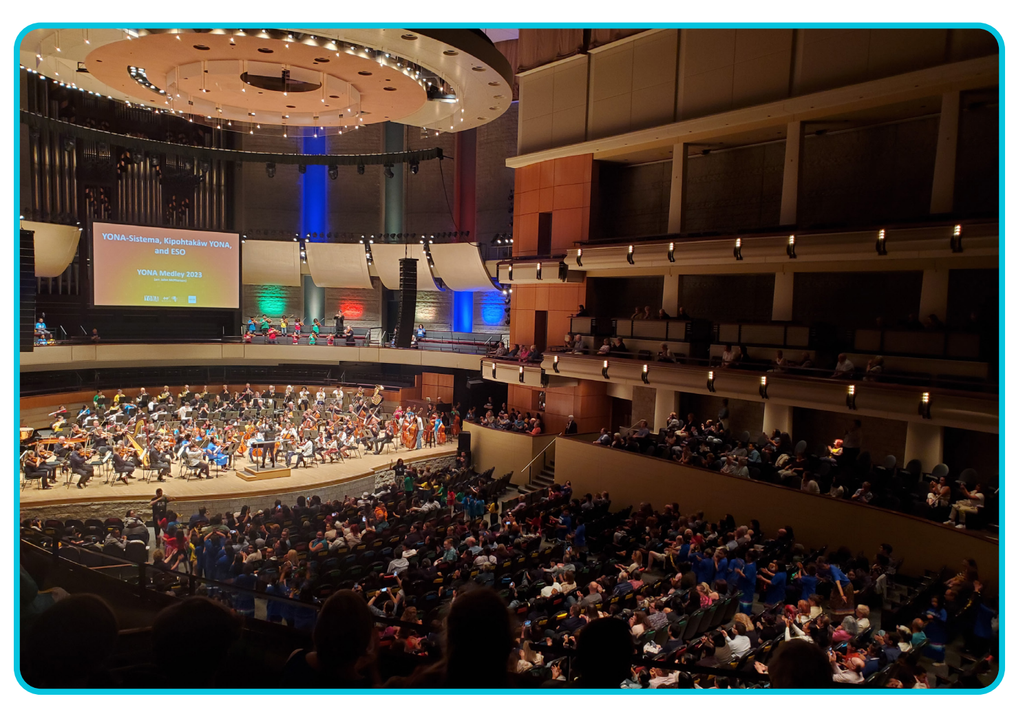
Road to Joy concert on May 31, 2023

At this year's Road to Joy fundraising concert, we raised over $115,000, with an additional $14,000 matched by an anonymous donor because you pledged a sustaining monthly gift!