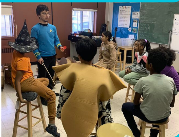
Halloween fun at YONA

After enjoying summer off, YONA Students returned to the program on September 11th eager to learn and make more music.