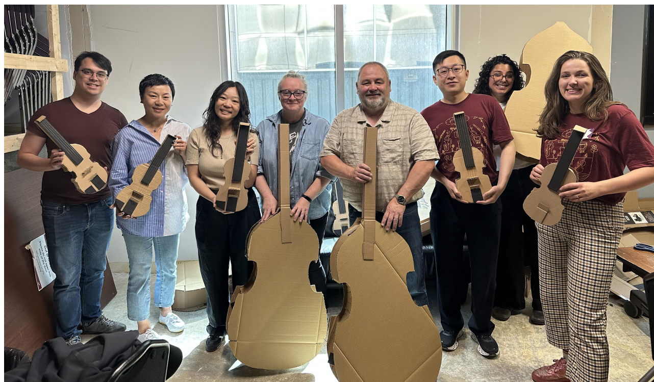
Cameron Corporation volunteers help to prepare cardboard instruments alongside YONA staff.

“Cameron Corporation is proud to continue our support of YONA and its mission to build an inclusive community where every child can thrive. We are especially honored to sponsor the nutrition program, as we believe that fueling young musicians with healthy food is essential for their creativity and focus. By ensuring no student practices on an empty stomach, we help empower them to reach their full potential.”