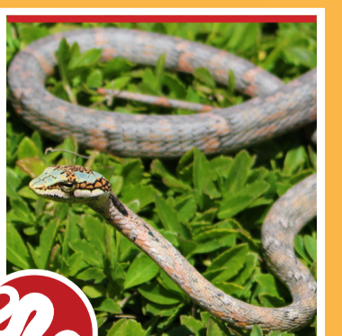
Boomslang ( Dispholidus typus viridis )